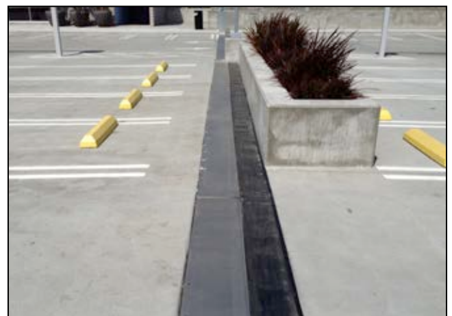
Parking Structure Expansion Joint