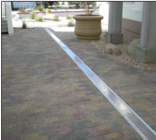
Archifectural Expansion Joint

West Coast Firestopping, Inc. is a specialty contractor located within the southern California area with a combined 20+ years of experience handling the coordination and installation of “specialty” items within a construction project including the installation of interior and exterior expansion joint systems designed to meet the unique demands of the construction industry.